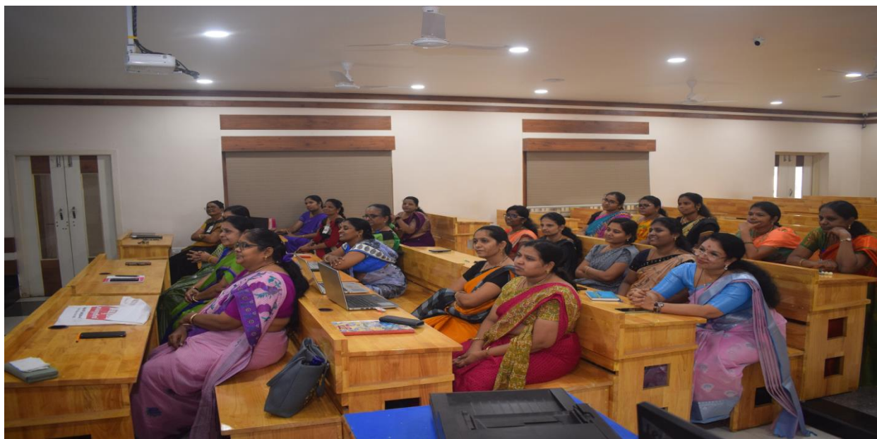
Fig:2 participated actively in workshop

The workshop started with the inauguration by Dignitaries at 9:00 AM on 30 January 2023. Ms. Girija Rani , Assist Prof and HOD of Nursing Research, welcomed the Gathering and introduced the Workshop to the audience. The sessions was started with Introduction of Qualitative research methodology and followed by various types qualitative research designs and its sampling technique, data collection and data analysis by various Speakers